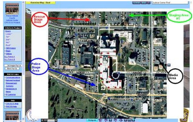
Screen Markup Tool - collaborate during incident