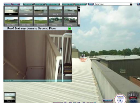
Detailed Views - roofs and stairway video