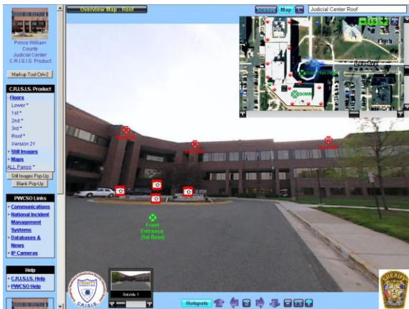
Virtual Walkthroughs - High res panoramic scenes