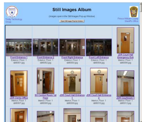
Photo album - Zoom-able Images and Data Sheets