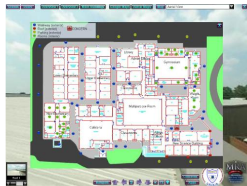
Overview maps - panoramic image locations